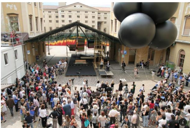
Manifesta is the European Nomadic Biennial , held in a different host city every two years. It is a major international art event, attracting visitors from all over the world. Manifesta is the go-to place for discovering emerging artists, thought-provoking ideas, new artworks especially commissioned for the event, and creative experiences in dialogue with spectacular locations of each host city.