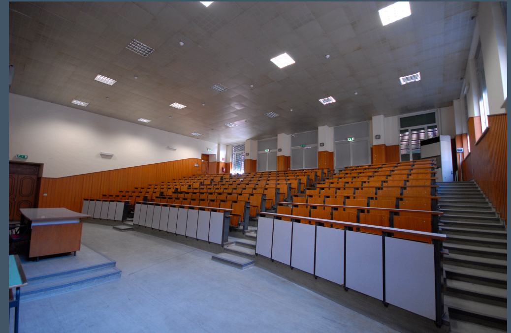
Aula Magna – Obstetric and Gynecologic Clinic