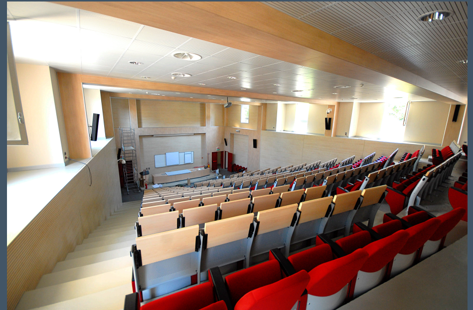
Aula Magna – Faculty of Medicine «Maurizio Ascoli»

UNIPA is also present in three other cities in Sicily, apart Palermo: Agrigento, Caltanissetta e Trapani . There is a closed link between UNIPA and the labor market: 3rd students of 1st cycle degree courses and 2nd year students of the 2nd cycle experience practice periods within public or private companies and agencies.