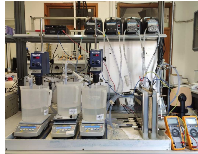
SEArcularMINE EDBM experimental set-up at the UNIPA laboratories

Computational fluid dynamics simulations of the Mg(OH)_2 precipitation process in the Mg-CGCR