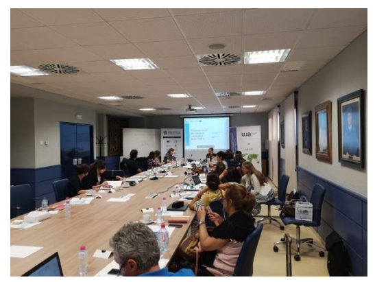
Panoramic of the meeting at the University of Jaen