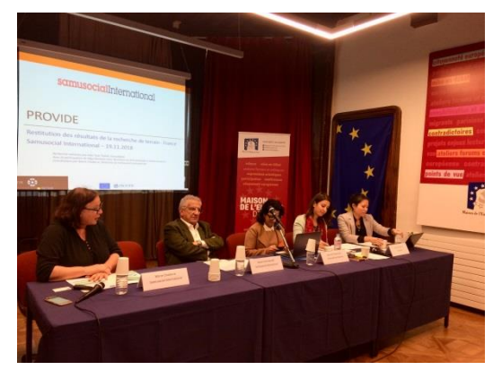
Conference table in Paris

"Expert in Proximity on Violence Management" which is going to be imparted on January and February.