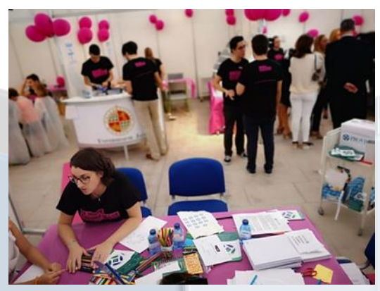
PROVIDE stand at the Researchers European Night

Additionally, the Jaen group decided on several meetings that they could not leave the opportunity to show the project on the well-known Researchers European Night when doing the InfoDay.