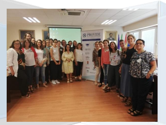
Assistants to the meeting

These conclusions highlight the suitability of the training courses that have already begun to take place as part of the next phase of the PROVIDE project.