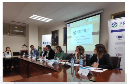
InfoDay at the University of Jaen

Likewise, an InfoDay was also held in Jaen (Spain) organized by the Association for Employment and Social Integration - ASEIS with the collaboration of the University of Jaen and the Alto Guadalquivir Health Agency.