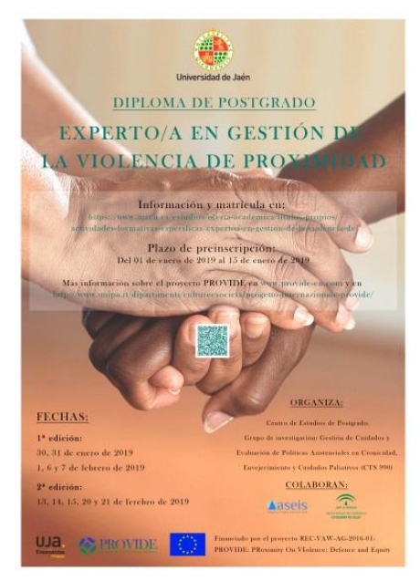
Poster for dissemination of the course in Jaen