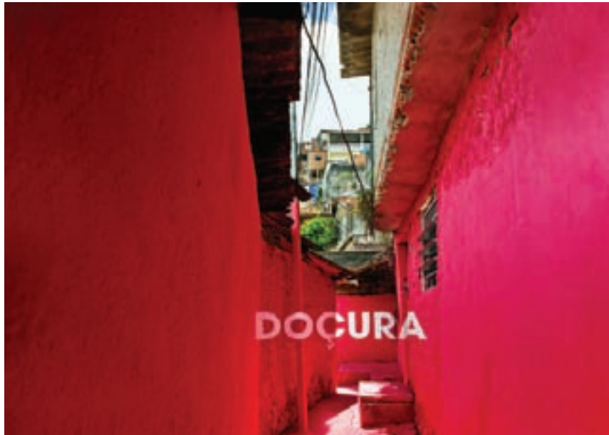
Fig. 10 - Luz nas vielas , São Paulo, Brazil, 2012. Doçura (by Boa Mistura).