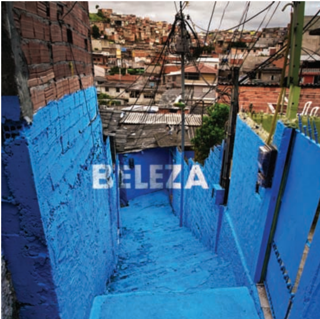
Fig. 7 - Luz nas vielas , São Paulo, Brazil, 2012. Beleza (by Boa Mistura).

pure oxygen in contexts otherwise destined for total degradation.