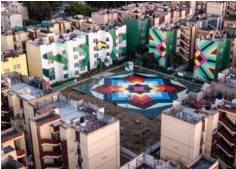
Fig. 14 - Nierika, Guadalajara, México, 2017.

Art is nothing more than an expression of culture, a tool to communicate what we are and our roots, that is why it is so important to keep our identities alive. We like to think that with our work we are bringing something positive to the cities. There's a friend from our neighbourhood who once told us "Doctors heal, mechanics fix cars, and artists move, touch people's hearts". For us, that is the