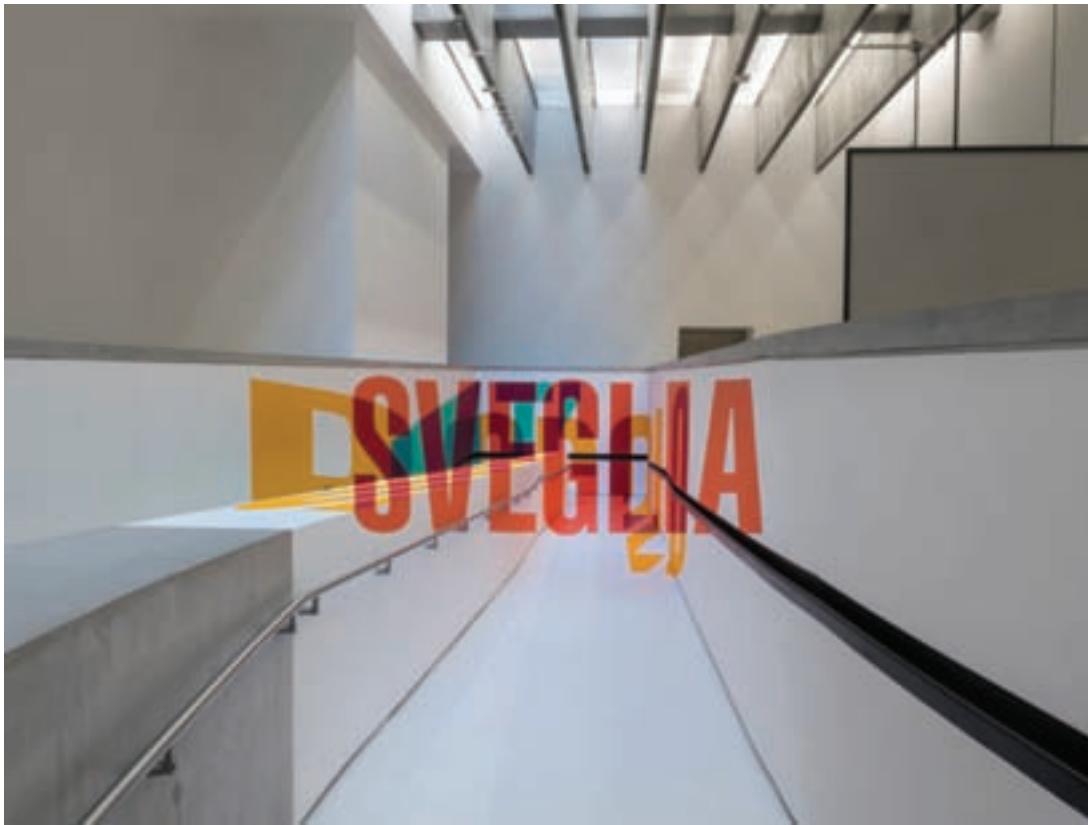
Fig. 17 - Cultura / Sveglia / Popolo , Roma, Italy, 2018. Sveglia (by Boa Mistura).

gation process, as we've already talked about.