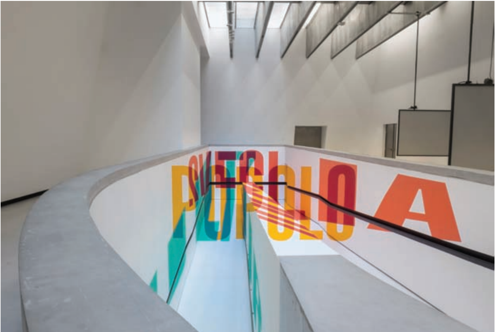
Fig. 16 - Cultura / Sveglia / Popolo , Roma, Italy, 2018. Popolo (by Boa Mistura).