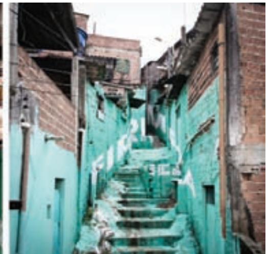
Fig. 8 - Luz nas vielas , São Paulo, Brazil, 2012. Firmeza (Boa Mistura).