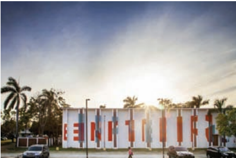
Fig. 2, 3, 4 - Pensar/Sentir , Panama City, Panama, 2014. (by Boa Mistura).

Pensar/Sentir is an intervention carried out in 2014 at the Ciudad del Saber (City of knowledge) in Panama City [3]. The artists worked with the students of the School of Architecture Isthmus using their signature anamorphic style. The chosen building is the Ecumenical Temple, turned today into an exhibition centre. In this case Boa Mistura intervenes on the building in two opposite directions, mixing on one facade the two words Pensar (think) and Sentir (feel) which can be correctly read, one at a time, from the two opposite ends. The words are two key elements in obtaining knowledge and wisdom (figs. 2-4).