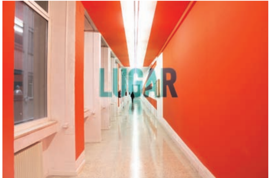
Fig. 5 - Lugar/Tiempo , Madrid, Spain, 2018. Lugar (by Boa Mistura).

words are revealed by traveling through space in the two opposite directions (fig. 5).