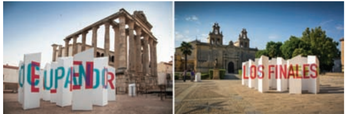
Fig. 18 - Laberintos Líricos, World Heritage Cities, Spain, 2016-2017. Left, Ocupando, Mérida; right, Los finales, Úbeda.

Author is truly grateful to Boa Mistura for granting the interview and for what the collective does through its art with deep sensitivity. All images courtesy of Boa Mistura.