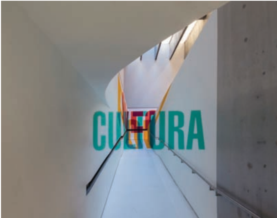
Fig. 15 - Cultura / Svegilia / Popolo , Roma, Italy, 2018. Cultura (by Boa Mistura).

most important thing, to agitate those who live with our work. This is the greatest improvement we can bring with.