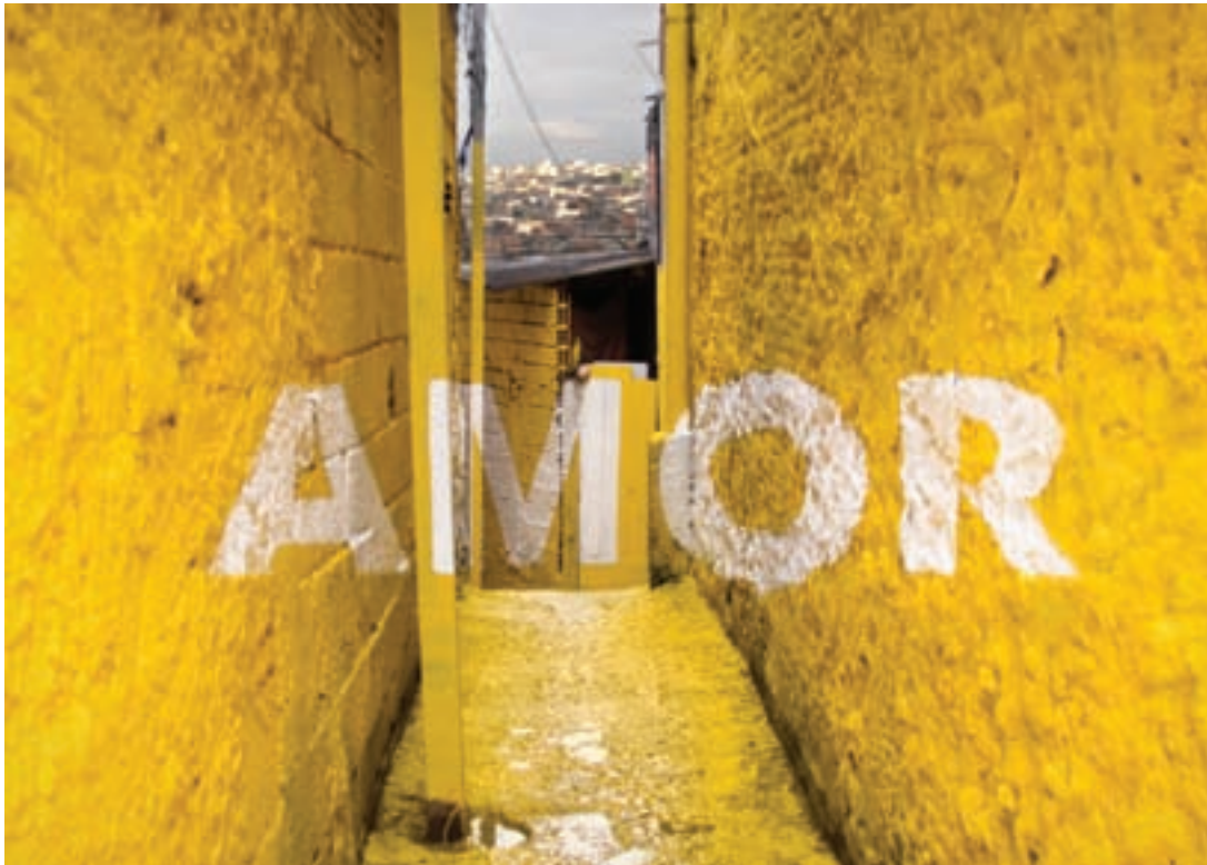
Fig. 6 - Luz nas vielas , São Paulo, Brazil, 2012. Amor (by Boa Mistura).

Anamorphosis is also used in the case of museum installations, as in the project carried out in 2018 at the MAXXI National Museum of Rome, in the context of collective exhibition “La Strada: dove si crea il mondo” [7]. Walking through a museum ramp it is possible to read three words from three different viewing spots, made with overlapping colors, through crossed anamorphosis (figs. 15-17). During a workshop given from Boa Mistura, the choice of the words Cultura (culture), Sveglia (wake up), Popolo (people) came from the answers that the participants gave the question “If the entire city of Rome