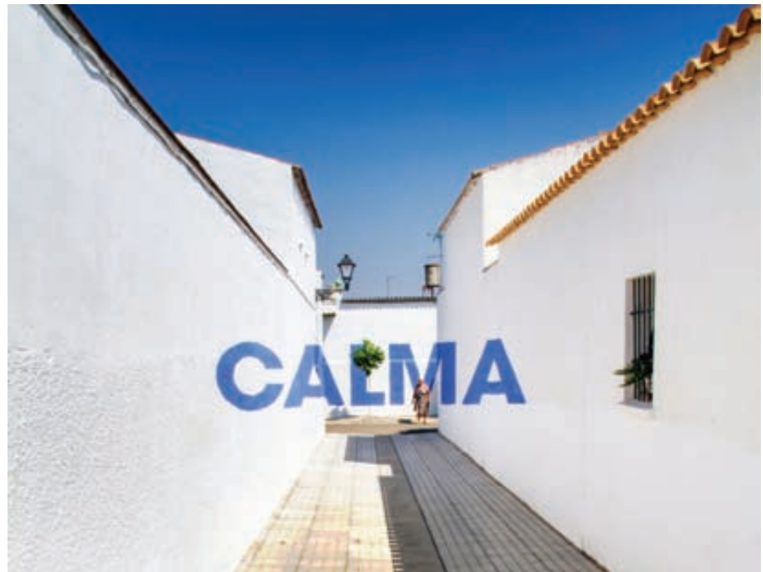
Fig. 1 - Azul sobre blanco , Cordoba, Spain, 2013 (by Boa Mistura).

anamorphosis interventions Azul sobre blanco (Blue over white) [2]. On the surfaces of small white houses, which are arranged between narrow alleys, six words materialise, blue like the colour of the sky that stands out on the white walls. Sosiego (quietude), Serenidad (serenity), Calma (calm), Remanso (haven), Claridad (clarity) and Luz (light) are the six words that summarise the life of two communities of Cordoba affected by the artistic intervention (fig. 1).