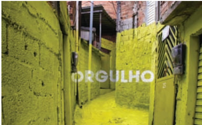
Fig. 11 - Luz nas vielas , São Paulo, Brazil, 2012. Orgulho (by Boa Mistura).

baggage, would be impossible to intervene. It is beautiful that such a technical and mathematical process produces such a magical result.