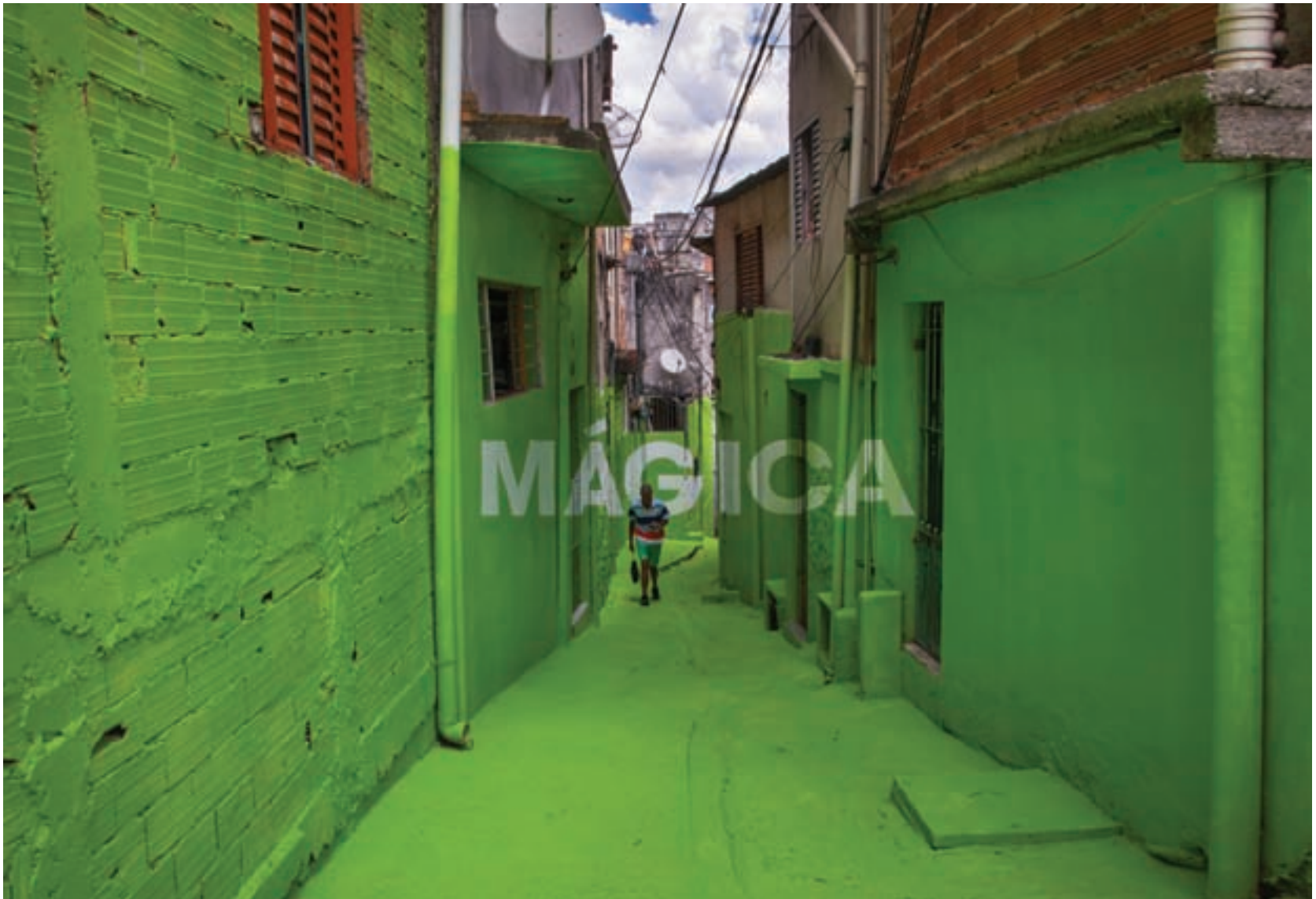
Fig. 12 - Luz nas vielas , São Paulo, Brazil, 2017. Mágica (by Boa Mistura).