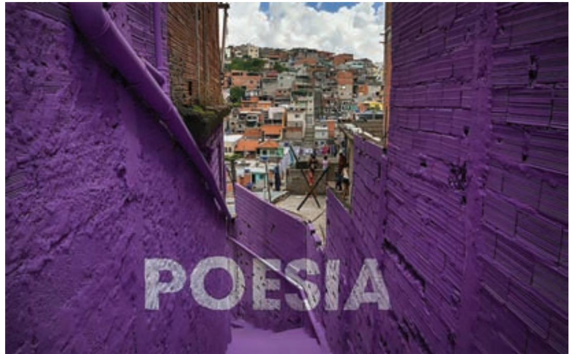
Fig. 13 - Luz nas velas , São Paulo, Brazil, 2017. Poesia (by Boa Mistura).

After that one, others came to keep the flame lighting. The Brasilândia favela where Luz Nas Velas was born, will always be our second home for the wonderful people who welcomed us as one of the family. In the Nierika project, in Guadalajara, Mexico, together with the neighbours, we managed to transform the use of a square so that it would stop being a drug selling point and begin to be used by the children and elders of the community; in Buenaventura, Colombia, in the houses of this humble coastal community we could see the marvellous style of